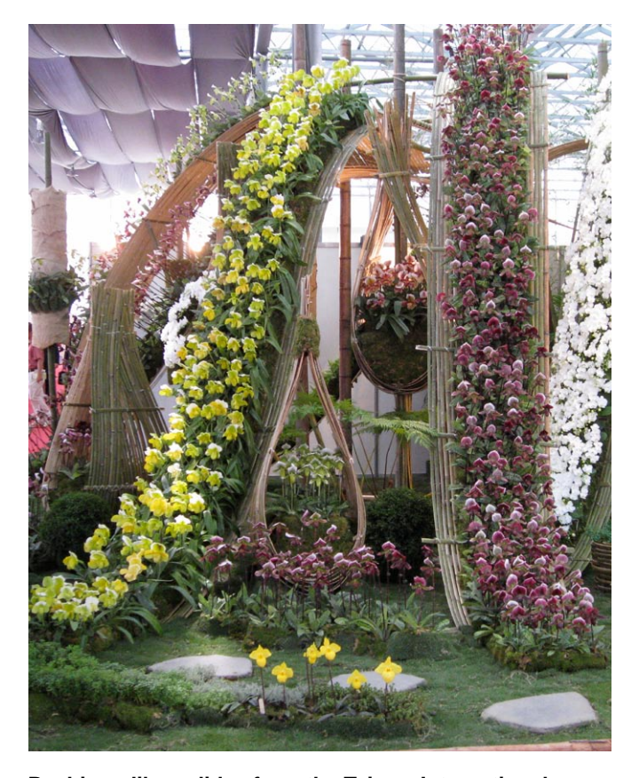
Paphiopedilum slides from the Taiwan International Orchid Show 2010.